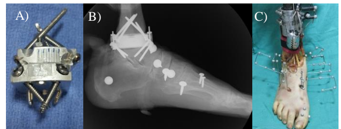
Figure 1: A) Anterior view of fusion fixture in misaligned position, B) lateral radiograph of fusion fixture implanted in specimen, C) reflective marker clusters connected to bone screws.

mounted on a six-degree-of-freedom robot that simulates the ground moving relative to the foot in walking. Actuators are connected to nine extrinsic foot tendons to simulate muscle forces. The input tibial kinematics and target ground reaction forces were taken from gait lab data of ten patients tested one year after ankle arthrodesis surgery. Specimens were tested in a walking stance phase simulation at 25% body-weight and one-sixth in vivo speed to avoid fixture damage. An 8-camera Vicon (Vicon Motion Systems, Oxford, United Kingdom) system tracked bone kinematics using a ten-segment model [5]. Reflective marker clusters secured to rigid wires were attached to bone screws inserted into each bone of interest in the model (Figure 1C). A pliance pressure mat (novel, Munich, Germany) was placed in series with the force plate.